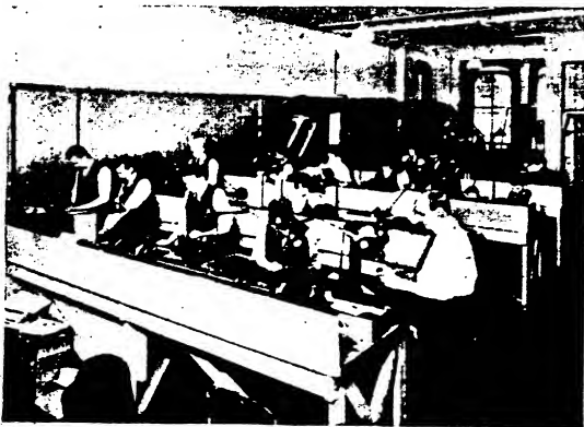
A Corner of the Moore Factory